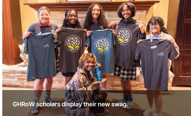
GHRoW scholars display their new swag.